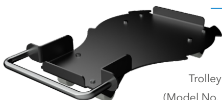
Trolley (Model No. K-TR)

KENO MINI with 1L/0.5L Polypropylene Bottle Built-in rechargeable battery enables operation without external power. Long runtime on a single charge.