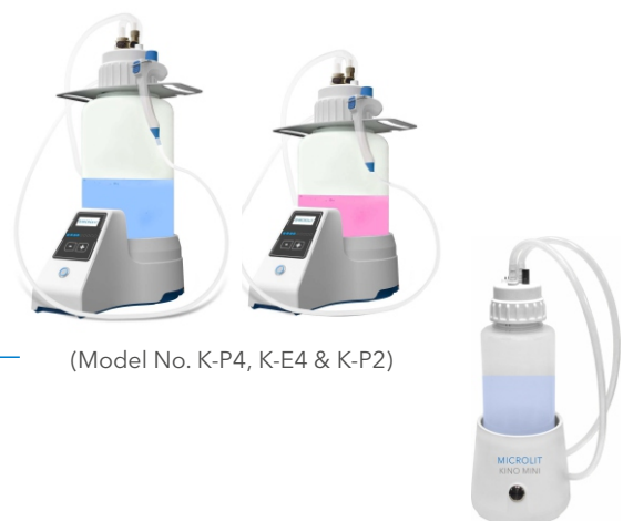
(Model No. K-P4, K-E4 & K-P2)

These are also used for removal of supernatant after centrifugation and disposal of culture media and clean-up of bench top spills.